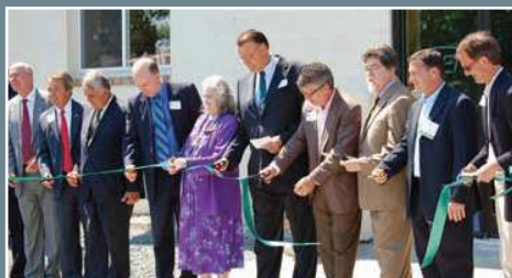
Cutting the ribbon at the dedication of renovated facilities for The Good Shepherd Alliance's Center of Hope that includes "Hope's Treasures" thrift store in Ashburn.