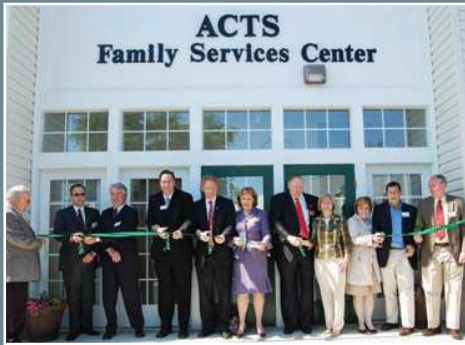
Cutting the ribbon on the new Family Services Center in Prince William County for Action in Community Through Service (ACTS)